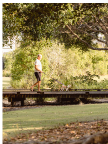
Walking paths and bikeways